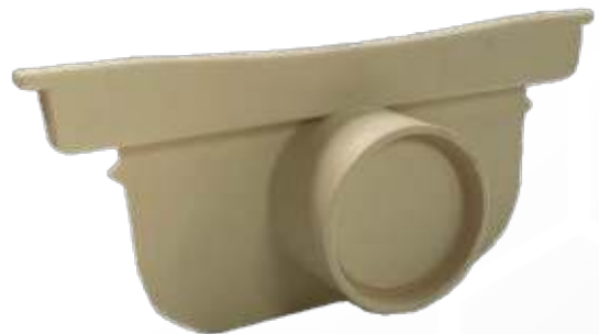
End cap Outlet

End Cap Outlets can be used at the end of the run to allow water to be taken to your exterior drainage pipes and away from the channel.